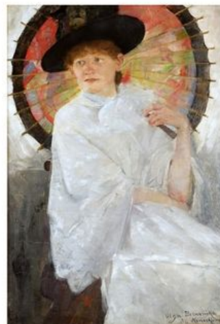
Young Lady with an Umbrella, 1886,