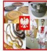
Polish Heritage Trust Museum